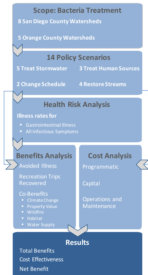
Figure 1. Summary of the CBA process including scope, major analyses and key results

For each scenario, the CBA performs (1) a health risk analysis that quantifies the illnesses expected given the scenario assumptions, (2) a benefits analysis that assesses health, recreation and environmental benefits compared to a business-as-usual baseline condition, and (3) a cost analysis that evaluates the costs of implementing each scenario's programmatic and structural practices (BMPs).